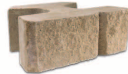
Straight Split 6/12