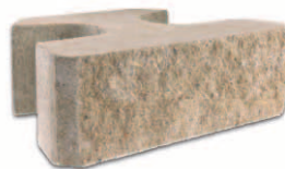
Straight Split 18